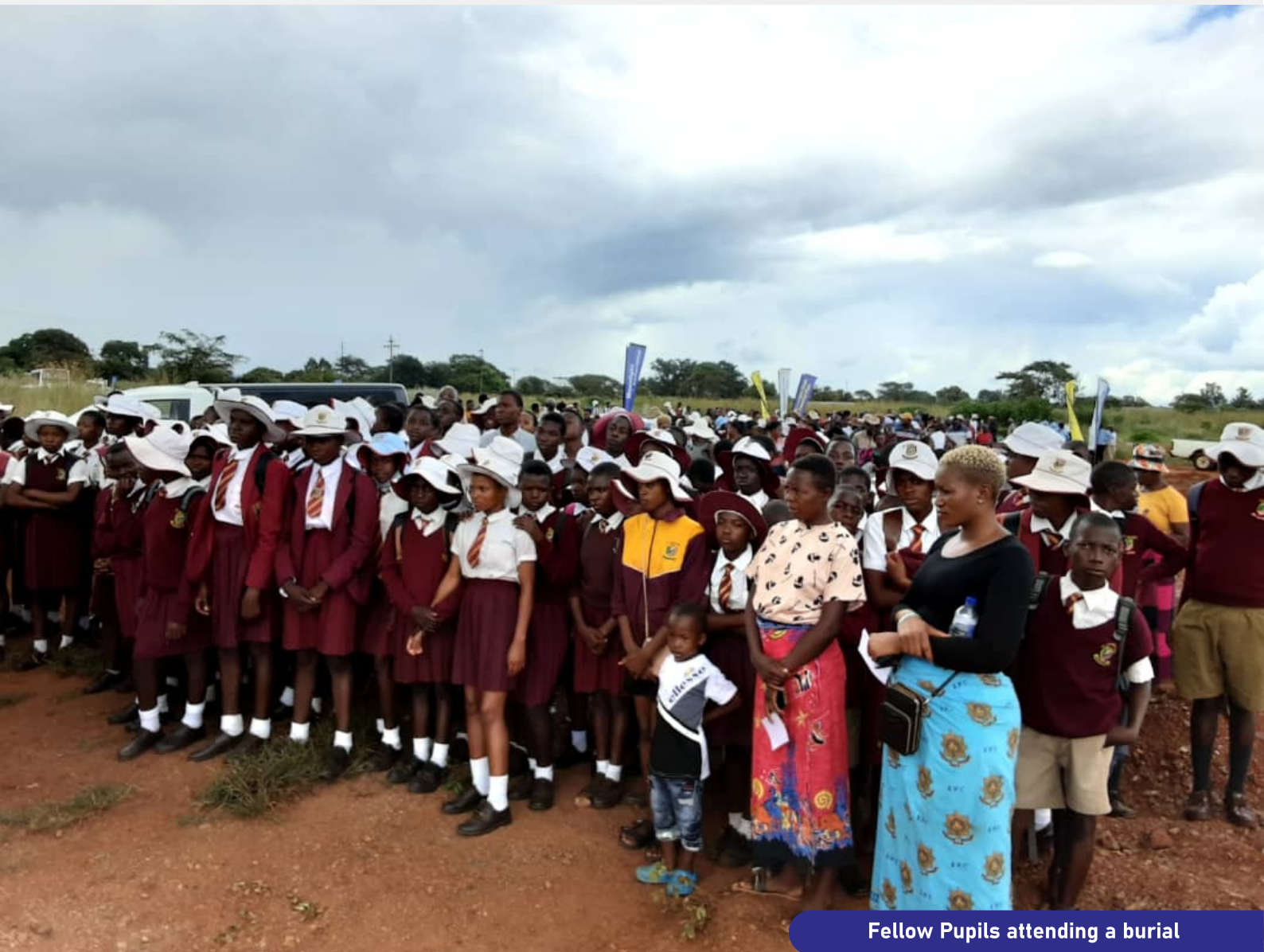
Fellow Pupils attending a burial

A s part of Moonlight`s innovation strategy and its keenness to participate in social responsibility tasks, it has launched the student Funeral Scheme to cater for the welfare of students as