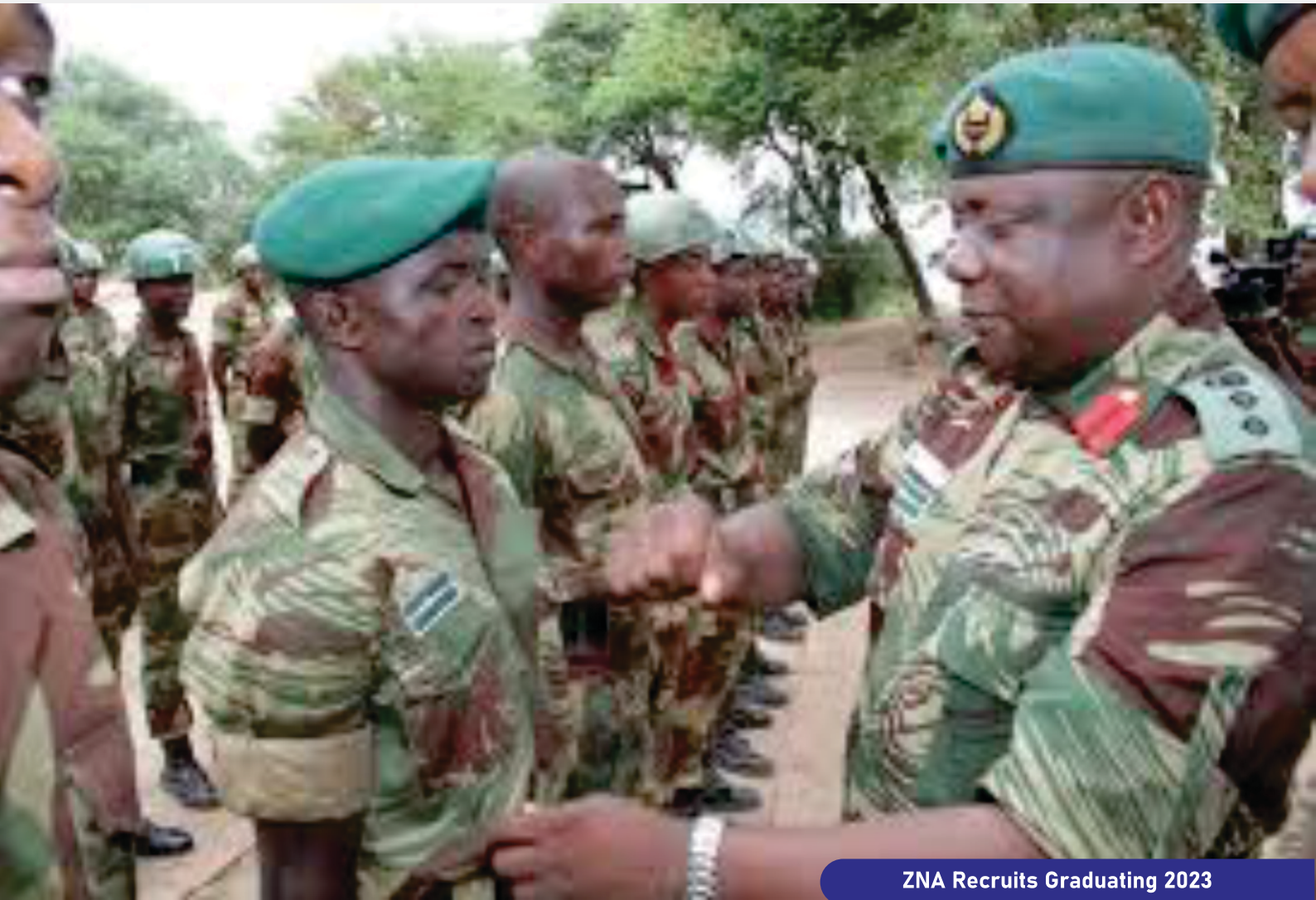
ZNA Recruits Graduating 2023

W e travelled to Bulawayo to attend the Zimbabwe National Army meeting where we intended to get some business in and 11 players attended namely Doves, Nyaradzo, ZimNat, Vineyard, Old Mutual, First Mutual, Foundation, Golden Knot, Fidelity and First Funeral. Total number of recruits at